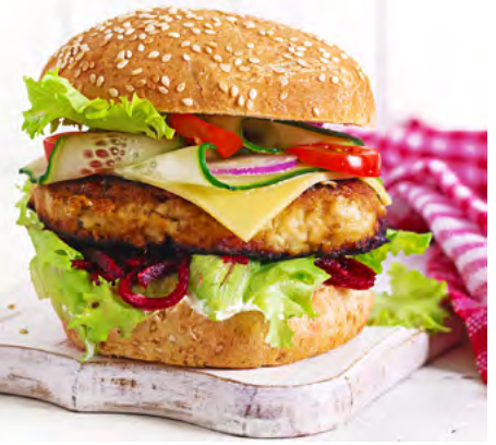
Try a grilled veggie burger instead of beef.